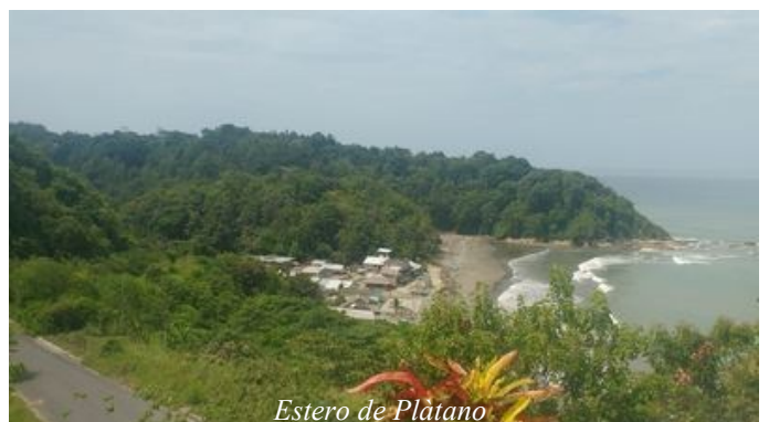
Estero de Plátano

Visitors can travel to less common destinations such as the marginalized communities that we work with.