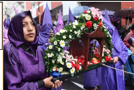
Good Friday in Quito—Semana Santa

The foundation has continued with its work on all fronts over the past two months. Our current project with the Tsa'chila culture will come to an end this July and we are looking beyond then to see what we can launch as a follow up. And at the Pacific coast region the new school year got under way so our "becados" program to offer scholarships to deserving youth to study at high school kicked off again at the end of April. We are grateful to all our Spanish students who pay a $25 registration fee towards this program as well as those who donated to the program via our annual Christmas fundraiser.